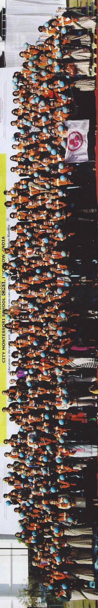
Reception of Hon'ble Chief Justices & Judges of the world on arrival at World Unity Convention Centre, Lucknow on 7th December 2012

FOR SAFEGUARDING THE FUTURE OF WORLD'S OVER 2 BILLION CHILDREN AND GENERATIONS YET TO BE BORN 13 th INTERNATIONAL CONFERENCE OF CHIEF JUSTICES OF THE WORLD ON ARTICLE 51 OF THE CONSTITUTION OF INDIA WORLD JUDICIARY SUMMIT 7-11 DECEMBER, 2012 CITY MONTESSORI SCHOOL GEMS, LUCKNOW, INDIA